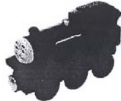
Red James Engine