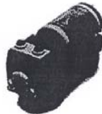
Red Water Tanker Truck