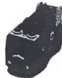
Red Hook & Ladder Truck